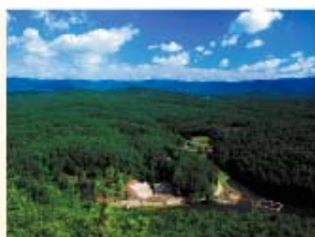
Old Hickory Council's Camp Raven Knob

Boy Scouts of America, Old Hickory Council 6600 Silas Cook Parkway, Winston-Salem, NC 27105 336-760-2890 www.oldsilascouncil.org